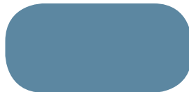
HAWAIIAN BLUE SR .32 SRI 35