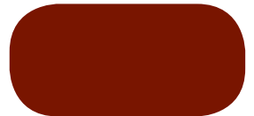
COLONIAL RED SR .34 SRI 37

Roof panels, wall panels and roll-formed gutter and gable trim are available in all Signature® 300 colors.