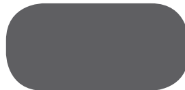
CHARCOAL GRAY SR .28 SRI 29