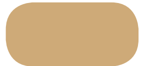
SADDLE TAN SR .48 SRI 56