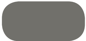
SLATE GRAY SR .37 SRI 41